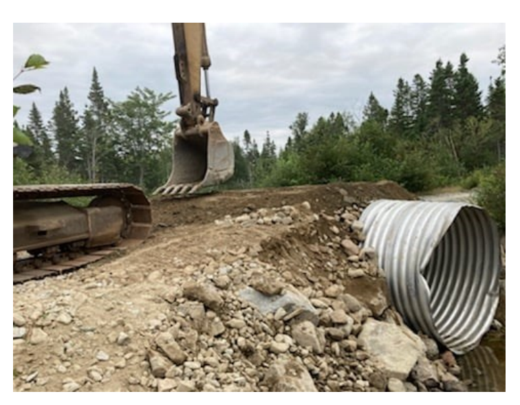
Kittiwake Snowmobile Association