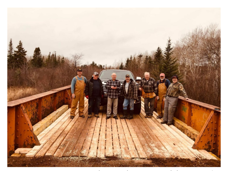
Exploits Trailnet Snowmobile Association