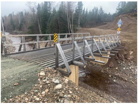
Green Bay Snowmobile Club