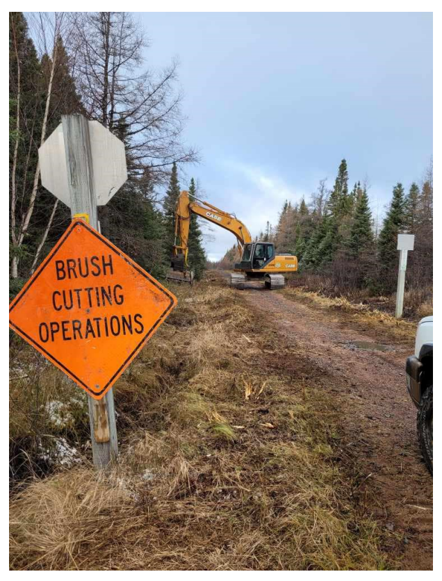
Notre Dame Snowmobile Club