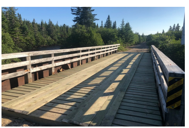
Bay St. George Snowmobile Association