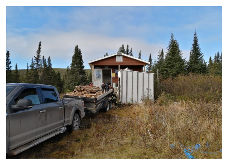
Junction Trail Blazers

We are ready for a new season of snow! From cutting brush to resupplying firewood in warm up shelters, our clubs and volunteers have been busy getting the trails ready for use this upcoming season. Through sponsorships and grants, clubs have also been able to complete much needed maintenance to trails and bridges over the summer and fall at various locations across the island.